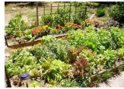
Community and School Garden Program