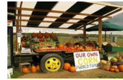
Farmer's Markets and Fresh Food Options