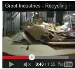
Virtual Tour Take a Tour of a Recycling Facility